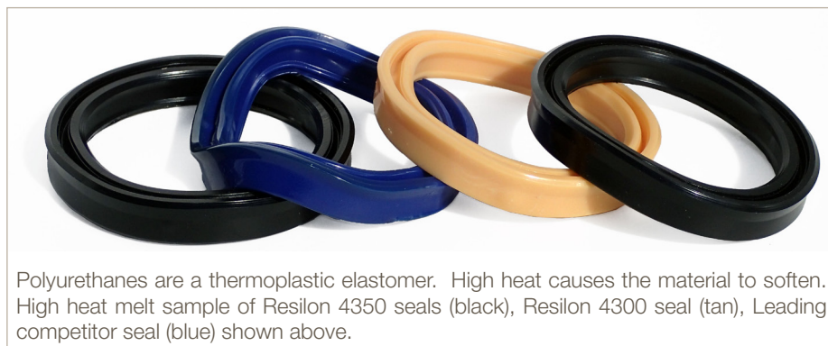
Polyurethanes are a thermoplastic elastomer. High heat causes the material to soften. High heat melt sample of Resilon 4350 seals (black), Resilon 4300 seal (tan), Leading competitor seal (blue) shown above.

Note: Values listed are typical values and should not be used as specification limits.